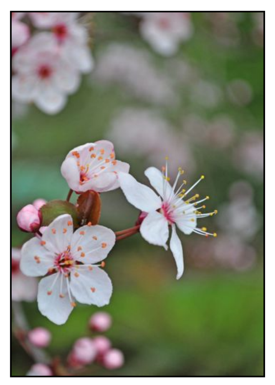
A Blush of Spring